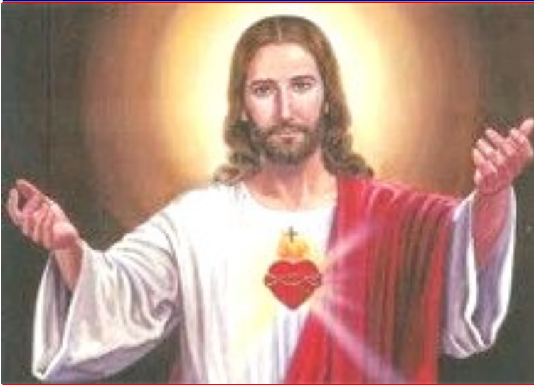
Image by Rahulmanoj "Jesus Love" https://commons.wikimedia.org/wiki/File:Jesus_love.jpg

"June, Month of the Sacred Heart of Jesus"